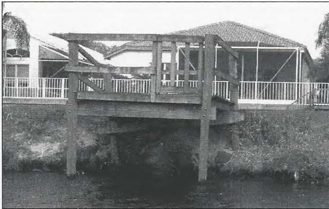
The Hillsboro Canal's right-of-way extends several feet landward from the top of the bank. The placement of encroachments such as a boat dock have caused the bank slope to erode or become detached and fall into the canal.

To guarantee the integrity of the Hillsboro Canal Bank Stabilization Project, the District will need to remove some of these encroachments. Residents may be able to replace some of the