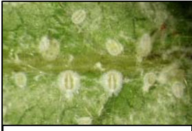
Whitefly immature stages

The crawler will molt and go through several immature stages that are oval and initially flat, then more convex. These stages do not resemble a typical insect. Some of these immature stages will secrete long white filaments of wax. It will likely survive year round in south Florida.