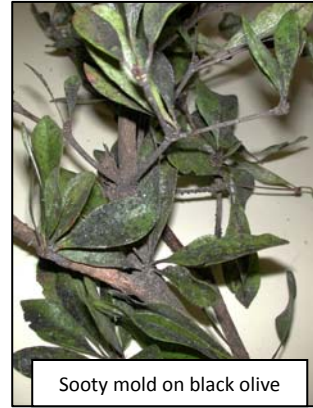
Sooty mold on black olive

Management in the Landscape: Often, when new pests arrive, they can reach very high populations and can be extremely damaging. It is not uncommon, however, that after several years, the impact is greatly reduced. Although it may be necessary to use insecticides for this pest, it is very important to understand the importance of natural enemies and the need to focus on long-term, biologically based management.