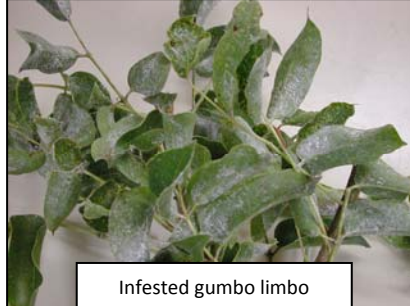
Infested gumbo limbo