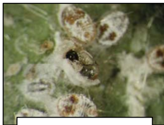
Parasitized whitefly pupae